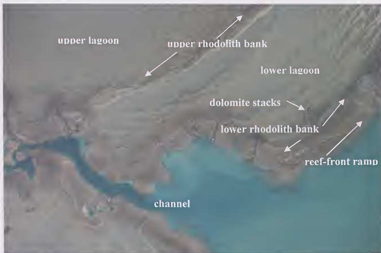
Figure 8. The south-eastern margin of Montgomery Reef, opposite High Clifty Reef. Note the broad reef-front ramp dissected at intervals by drainage gutters, and the reef crest with rhodolith banks impounding shallow pools on the midlittoral reef flat with pools. Running diagonally across the top left corner is the higher complex of rhodolith banks that impound the high lagoon. A major drainage channel entering from the left originates in the high lagoon.

narrow strips of algal pavement. These clear water pools also contain abundant coarse sand and calcareous mud.